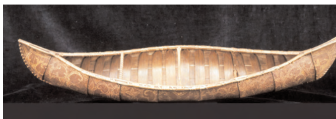
Model of a Passamaquoddy birch canoe.

What are these boats made from? You can even see maps made from sticks, plant fibers, and shells! Used by people sailing the ocean, they show water currents and islands.