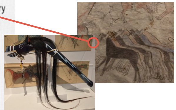
Take your pick! There are many horses in this gallery.