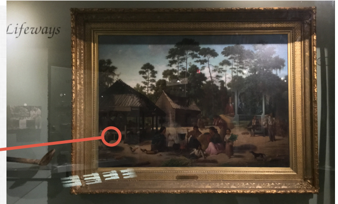
Chickens in the painting in the Southeast